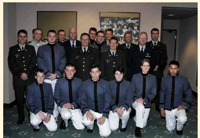
Members of faculty and cadets pose after the announcement of the new SURI program in 2002.