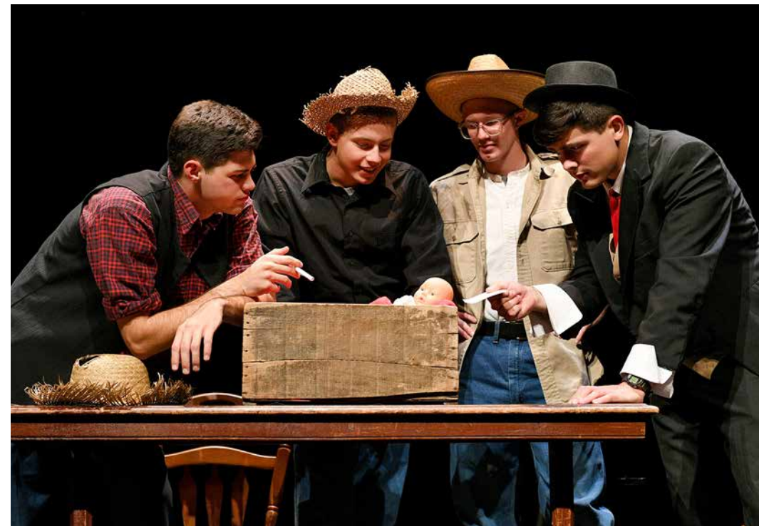
Cadets perform in “The Best of the West” in Gillis Theater during Family Weekend.