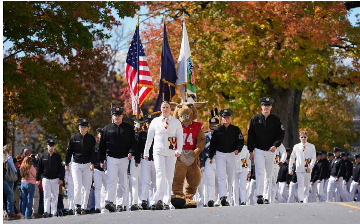
Cadets march down to the football game Oct. 21.