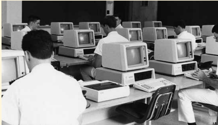
Cadets work in a new computer lab in 1985.